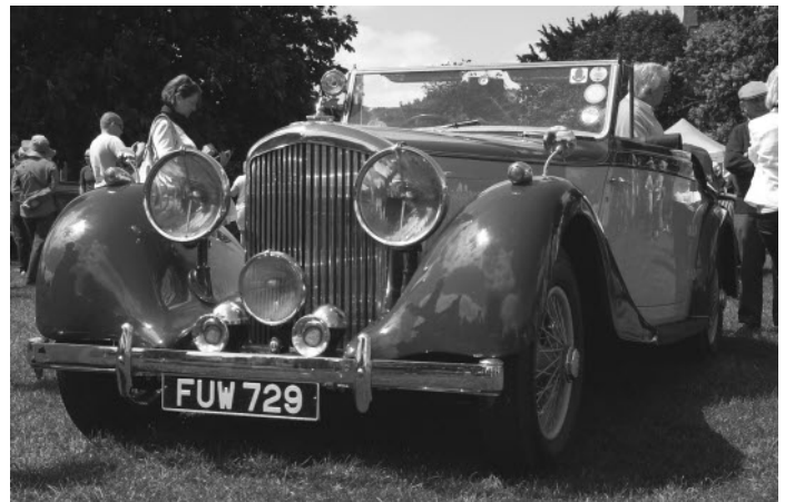
Bentley 4.25ltr 1939 Drop Head Coupe