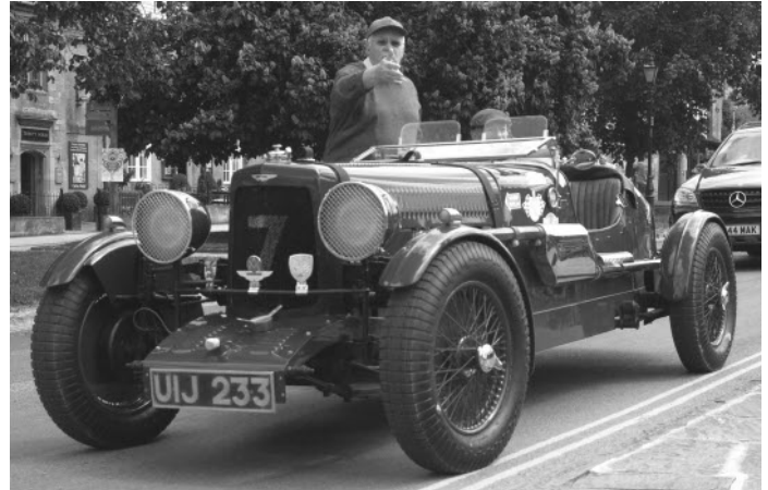
1934 1800cc Aston Martin Ulster one of only 35 made

The Gloucestershire Warwickshire Railway and The Ashmolean Broadway Museum who had stalls at the show, both received an enormous amount of support from the visiting spectators.