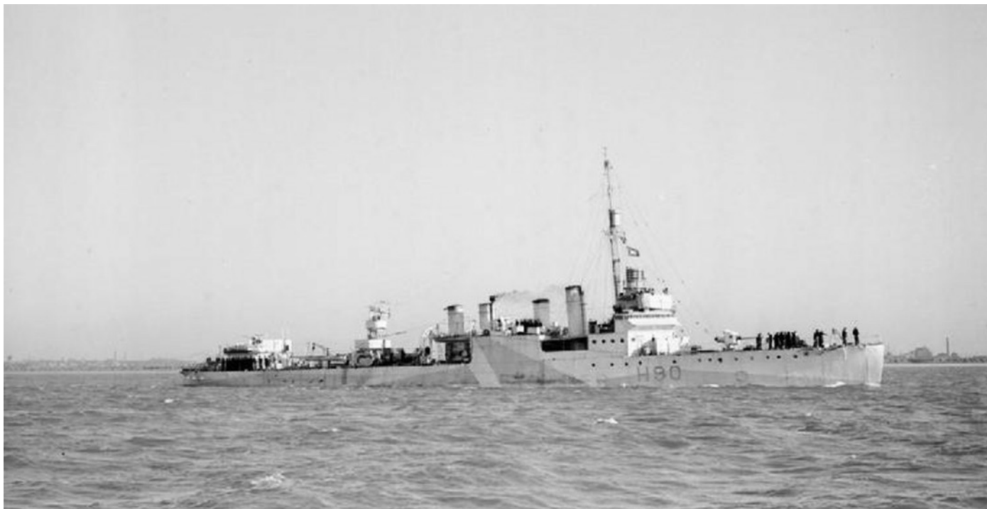
HMS BROADWAY, a destroyer built in 1918.