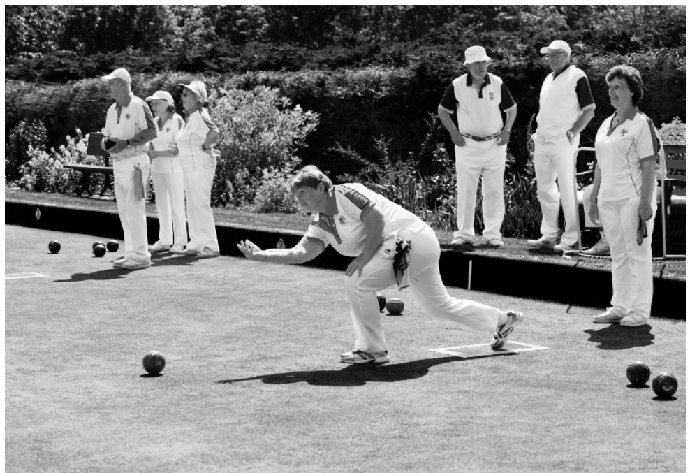
Broadway Bowling Club friendly match against a touring team from Leicestershire